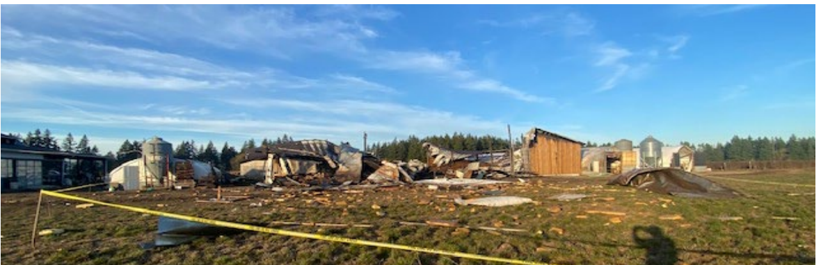
Post explosion: Across from reefer trailer that exploded.

Findings: St. Paul Fire District firefighters follow specific Standard Operating Guidelines (SOG) for different types of responses. Dispatch reported the event as a barn fire and firefighters followed the SOG for a structural fire. The firefighters knew the container was refrigerated so they checked an emergency response guidebook that is present in all first responder vehicles for an appropriate response procedure; the guidebook included response procedures for the refrigerant (R134a) in cylinders and tanks, but it does not have a procedure for R134a used in reefers.