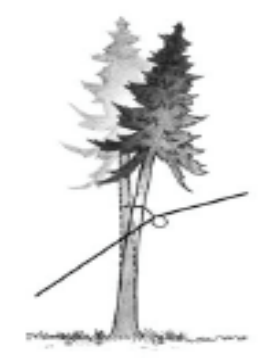
Figure 7-18 - Guyline - Tail Tree Stability