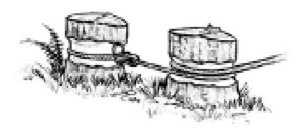
Figure 7-21 - Stump Tie Back Anchor

(graphic below was removed with AO 2-2005, f. 5/27/05, ef. 6/1/05)