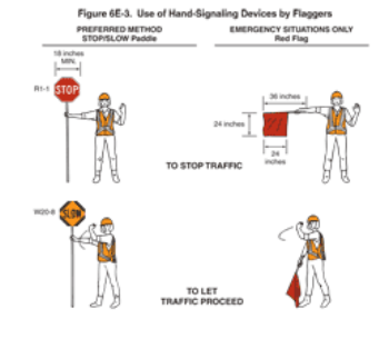
Figure 6E-3 Use of Hand-Signaling Devices by Flaggers