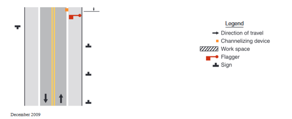
Figure 6C-3. Example of a One-Lane, Two-Way Traffic Taper