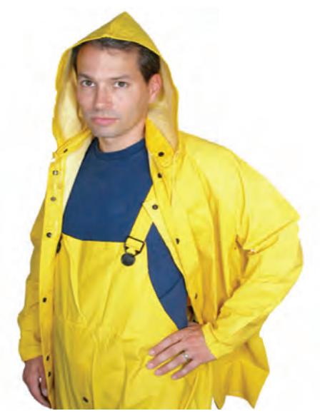
Polyvinyl chloride (reusable)

Pesticide labels must have signal words, which describe the acute (short-term) toxicity of the formulated pesticide product. The signal word will be one of the following: DANGER/POISON, DANGER, WARNING, or CAUTION. Products with the DANGER/POISON signal words are the most toxic. Products with the signal word CAUTION are comparatively less toxic. All products must be handled with care.