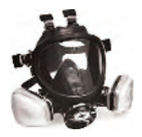
A full-face respirator