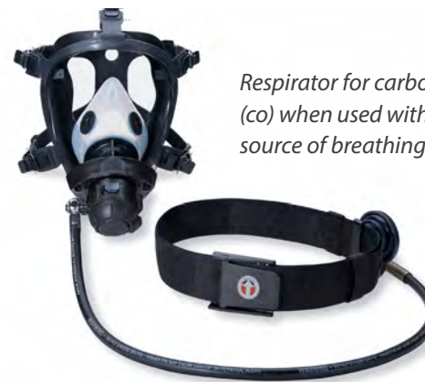
Respirator for carbon monoxide (co) when used with an appropriate source of breathing air.

For more information, see OAR 437-004-9000 Air Contaminants .