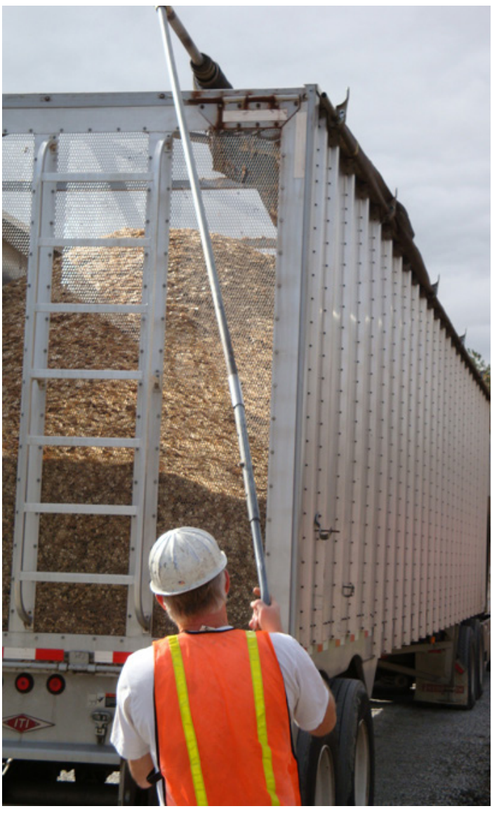
Tarping a chip van

Use safe work practices when fall protection systems are not available.