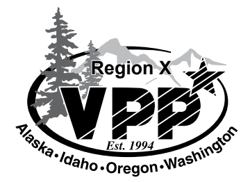
Exhibit Information and Rules

May 14-16, 2024 • Dena'ina Center • Anchorage, Alaska