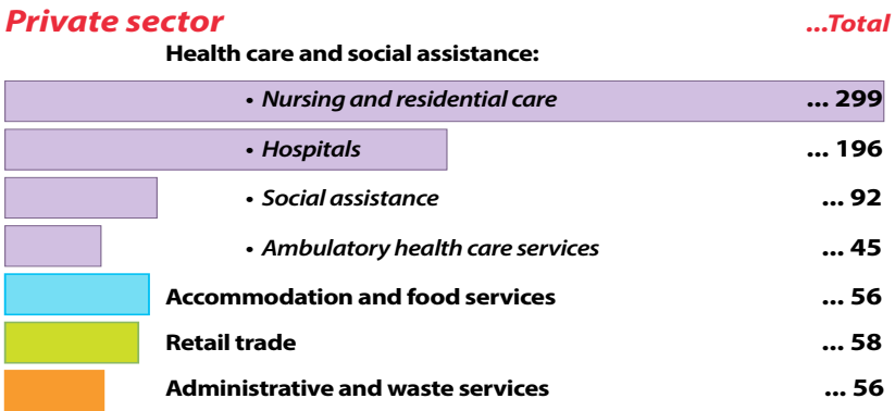
Table 2. Accepted disabling claims (from assault), by industry