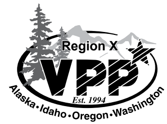
Exhibit Information and Rules

May 12–14, 2020 • The Grove Hotel and the Boise Centre • Boise, Idaho