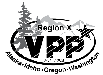
Exhibit Information and Rules

May 10–12, 2022 • The Grove Hotel and the Boise Centre • Boise, Idaho